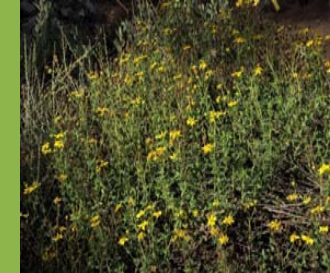
San Diego County Sunflower

Habitat: Nest in multiple substrates including trees, buildings, cavities, shrubs, and bare ground