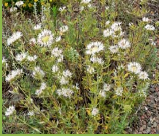
Felt Leaved Monardella